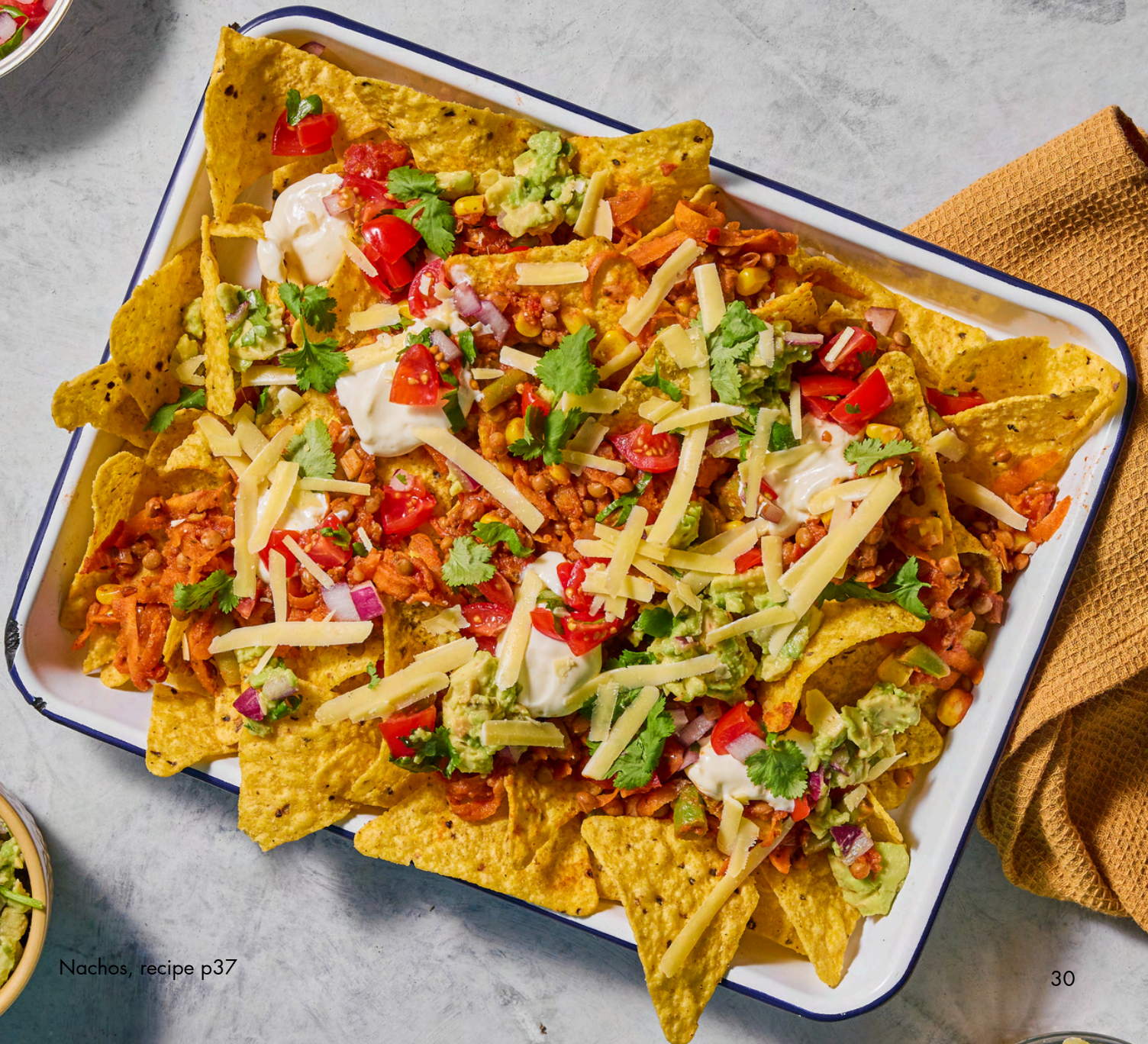
Nachos, recipe p37